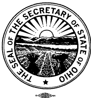
Jennifer Brunner Secretary of State of Ohio

NOTARIA NOVENA DEL CANTON CUENCA DE ACUERDO CON LA FACULTAD PREVISTA EN EL NUMERAL 5 DEL ART. 18 DE LA LEY NOTARIAL, DOY FE: QUE LA COPIA QUE ANTECEDE ES IGUAL AL DOCUMENTO PRESENTADO ANTE MI EN FE: CUENCA DE 28 JUL. 2010