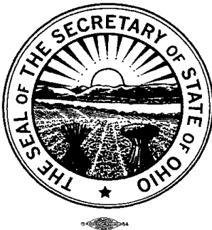
Jennifer Brunner Secretary of State of Ohio

NOTARIA NOVENA DEL CANTON CUENCA DE ACUERDO CON LA FACULTAD PREVISTA EN EL NUMERAL 5 DEL ART. 18 DE LA LEY NOTARIAL, DOY FE: QUE LA COPIA QUE ANTECEDE ES IGUAL AL DOCUMENTO PRESENTADO ANTE MI EN FS. _____ CUENCA DE 28 JUL 2010