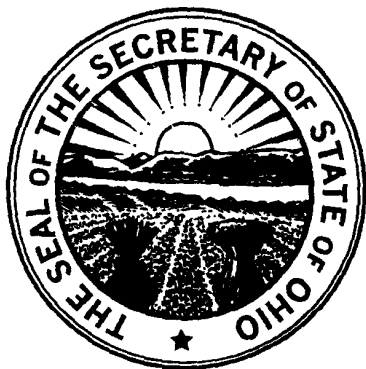
Jon Husted Secretary of State of Ohio